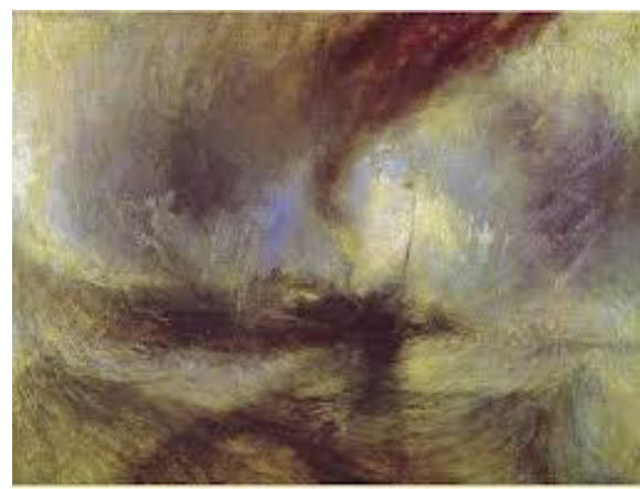
Snowstorm – Steam boat at Harbour Mouth... (Turner – 1842)

The upshot was that from them kindly sharing their knowledge and expertise with me, I could now see that taking what I knew from mechanical engineering across to construction was not going to be as problematic as I had first imagined. That came as some relief, I can tell you! There were still clearly big gaps in my knowledge base, but the other members of the VSO team assigned to this project with me were almost certainly going to cover my shortfalls. Now I had got back into the saddle and felt comfortable with it after a 5-year absence from the world of work, I was really looking forward the Mongolian challenge ahead.