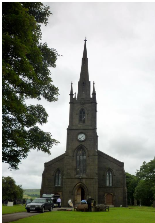
St. Ann's Church, Turton