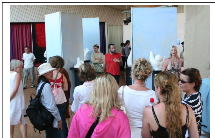
The Big Day

which were to be mounted her Life Series sculptures.