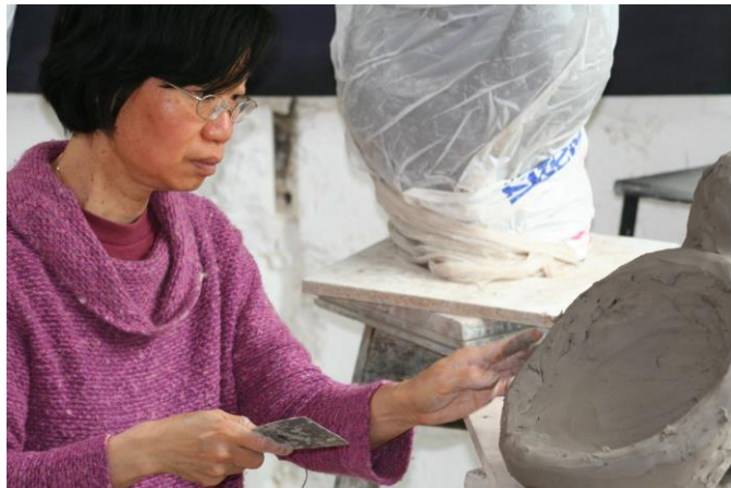
Modelling in Clay to Cast in Plaster of Paris