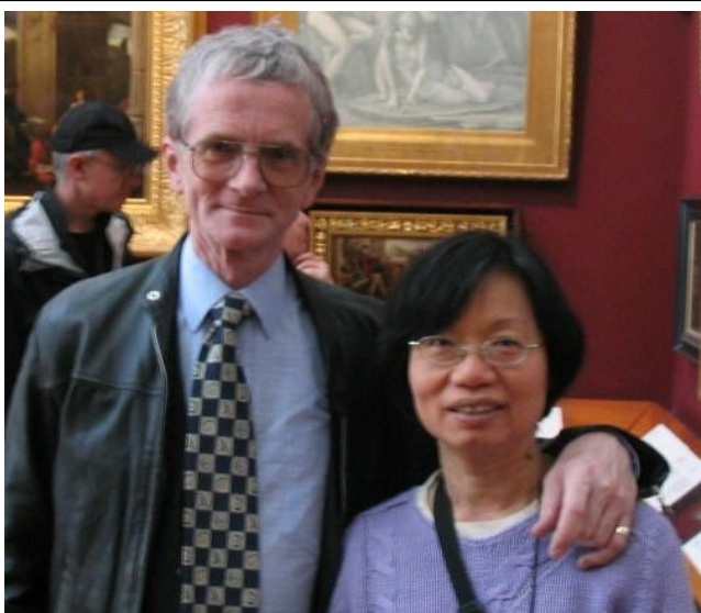
Our First Photograph Together at the V&A

fac-ed. When I asked her, what was the matter, she responded by saying that she did not want ours to be a short-term relationship. I returned the smile to her face by proposing that we should be married perhaps after our Mongolian adventure, assuming of course that she still wanted to be with me after that. Two Mongolian winters I felt would surely test any fledgling relationship. That very short snippet of an exchange between us, slotted in with our everyday day kind of chitchat, sealed the deal. Two years later, on the 9 th July 2008, we did indeed get married in Singapore.