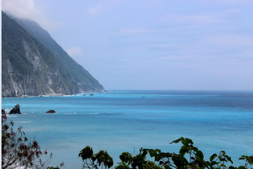
Taiwan's Pacific Coast